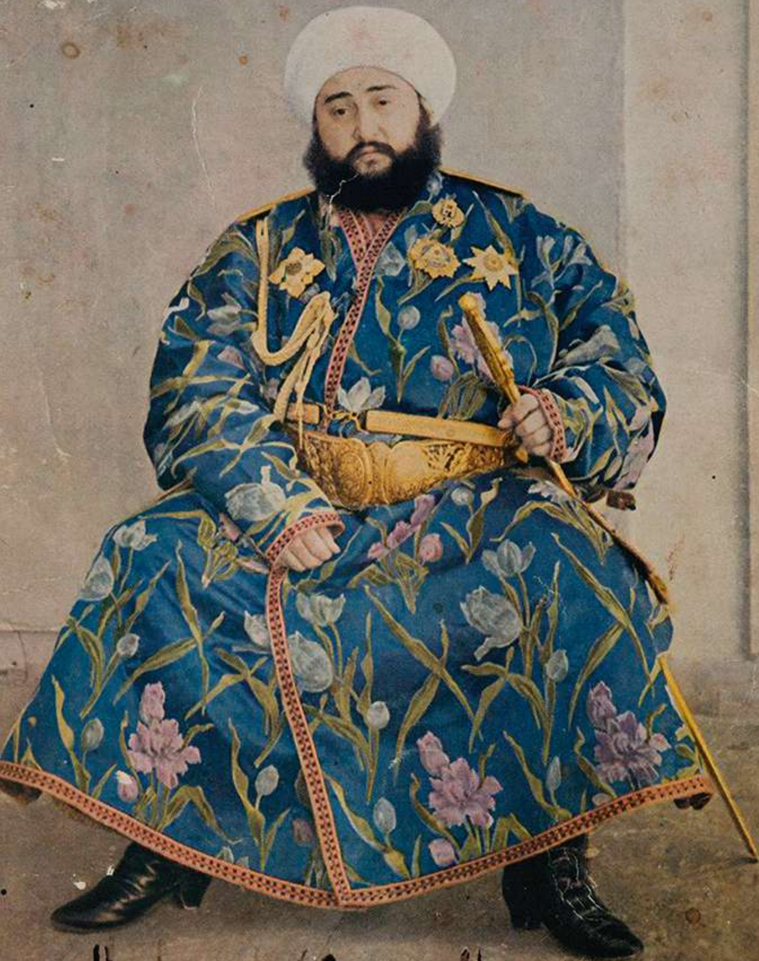
سید امیر عالم محمد شاہ سلطان