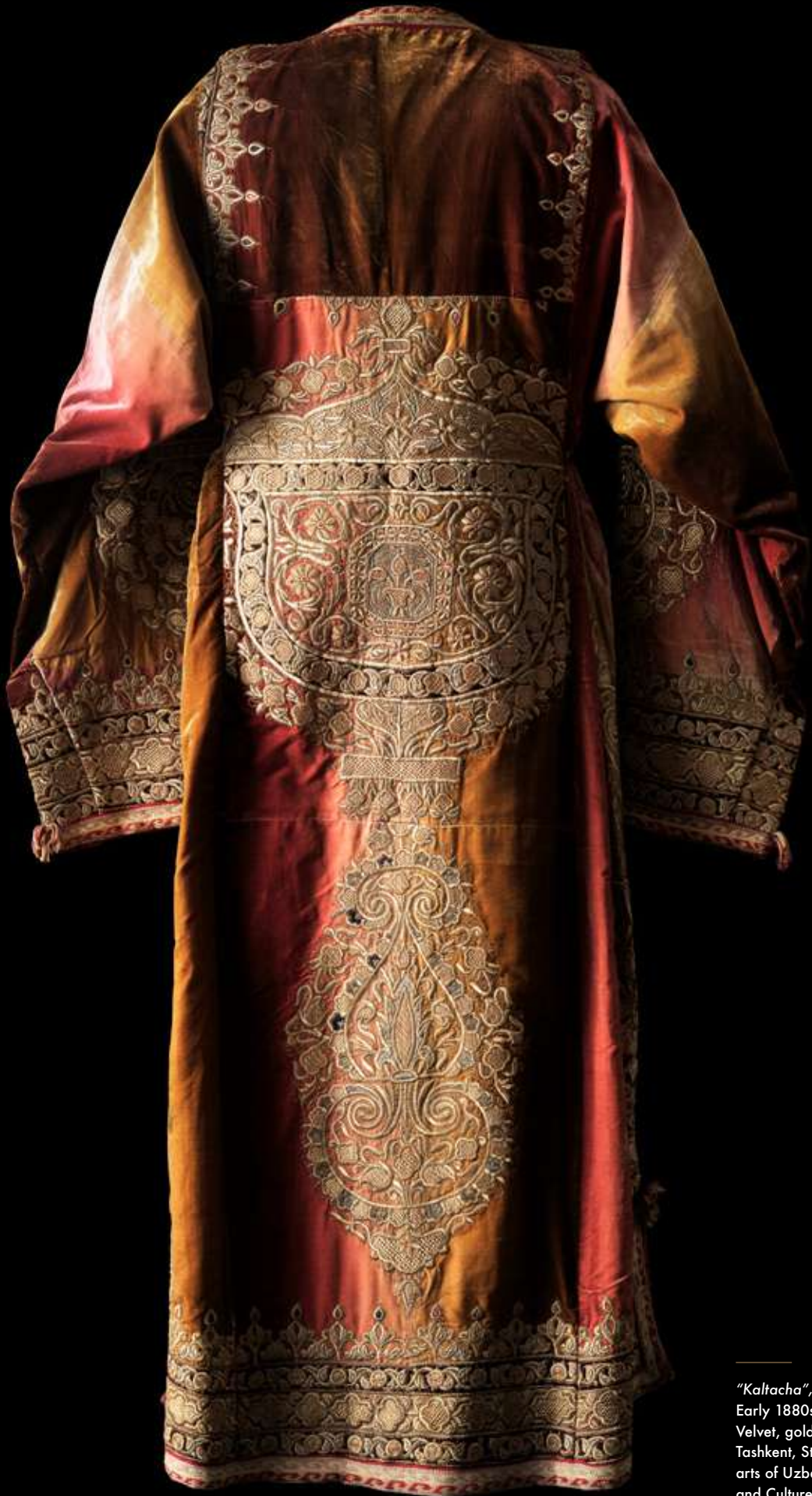
"Kaltacha", outer garment. Early 1880s, Bukhara. Velvet, gold embroidery. Tashkent, State Museum of arts of Uzbekistan