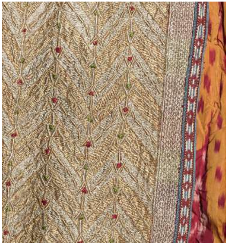
"Darkham"- style chapan. Late 19th–early 20th century, Bukhara. Samarkand, Samarkand State Museum-Reserve