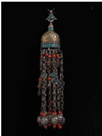
Fragment of a pectoral ornament "Peshikhalta", late 19th–early 20th century, Metal, coral and turquoise, Nukus, State Museum of History and Culture of the Republic of Karakalpakstan