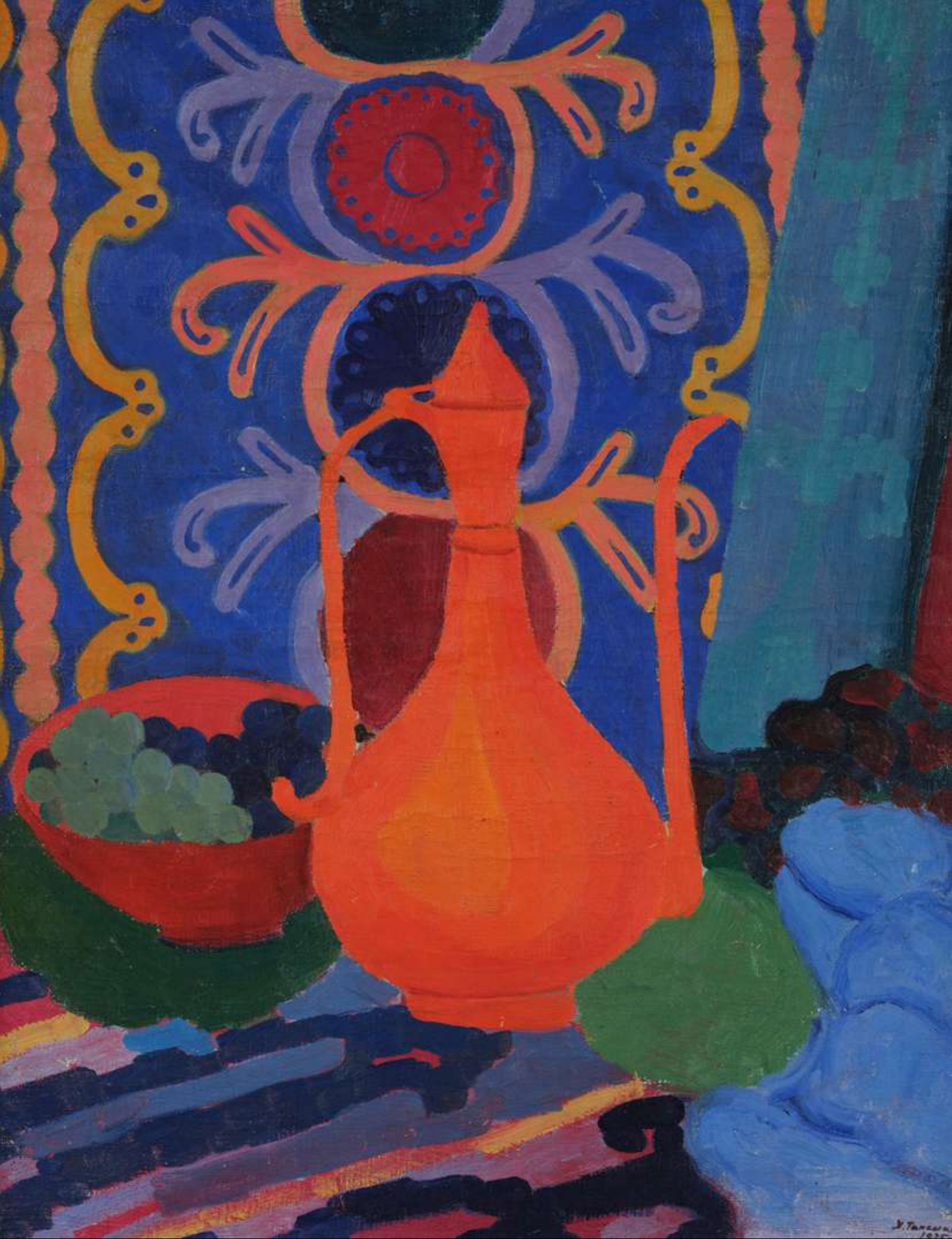
Ural Tansykbayev (1904–1974), Kumgan , 1935. Oil on canvas, Nukus, State Museum of Arts of the Republic of Karakalpakstan named after I.V. Savitsky © The Art and Culture Development Foundation of the Republic of Uzbekistan © Harald Gottschalk