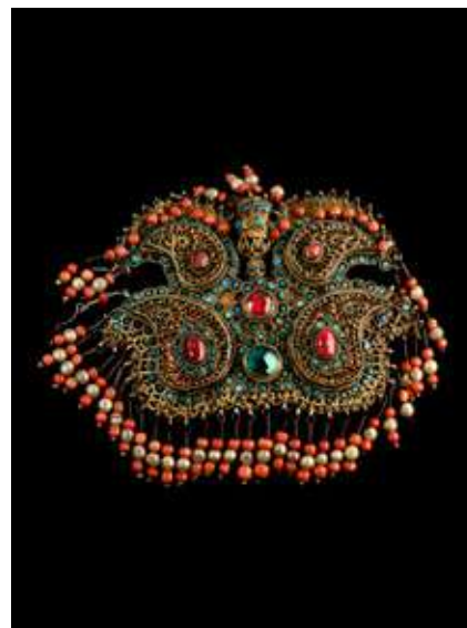
"Tadj-duzi" pectoral ornament, late 19th century, Khorezm. Silver, coral, coloured glass, filigree, inserts, Tashkent, State Museum of Arts of Uzbekistan © The Art and Culture Develop- ment Foundation of the Republic of Uzbekistan © Laziz Hamani