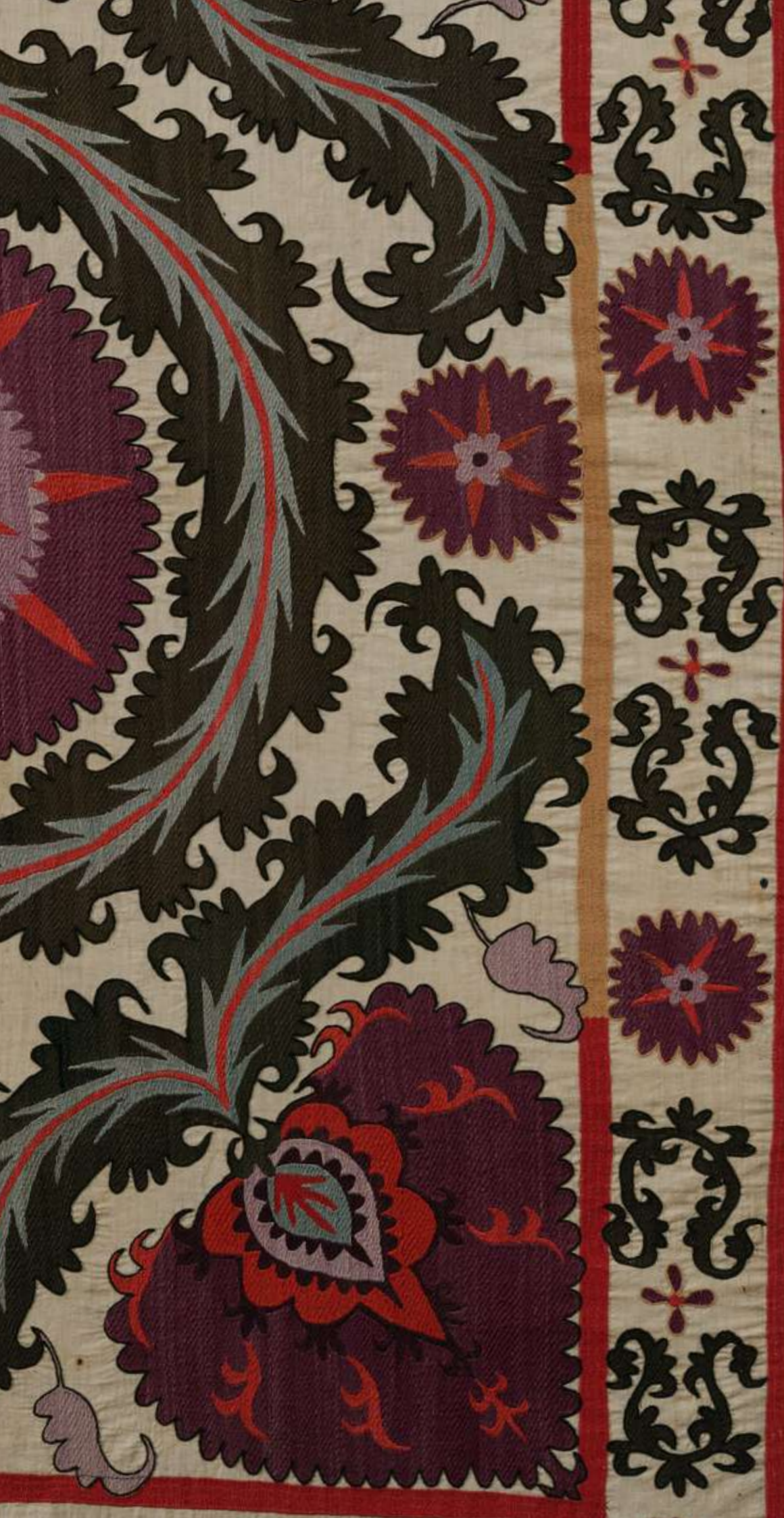
"Takiyapush" bed cover, Nurata school, c. 1867, Nurata, cotton, coloured silk thread, Tashkent, State Museum of Arts of Uzbekistan