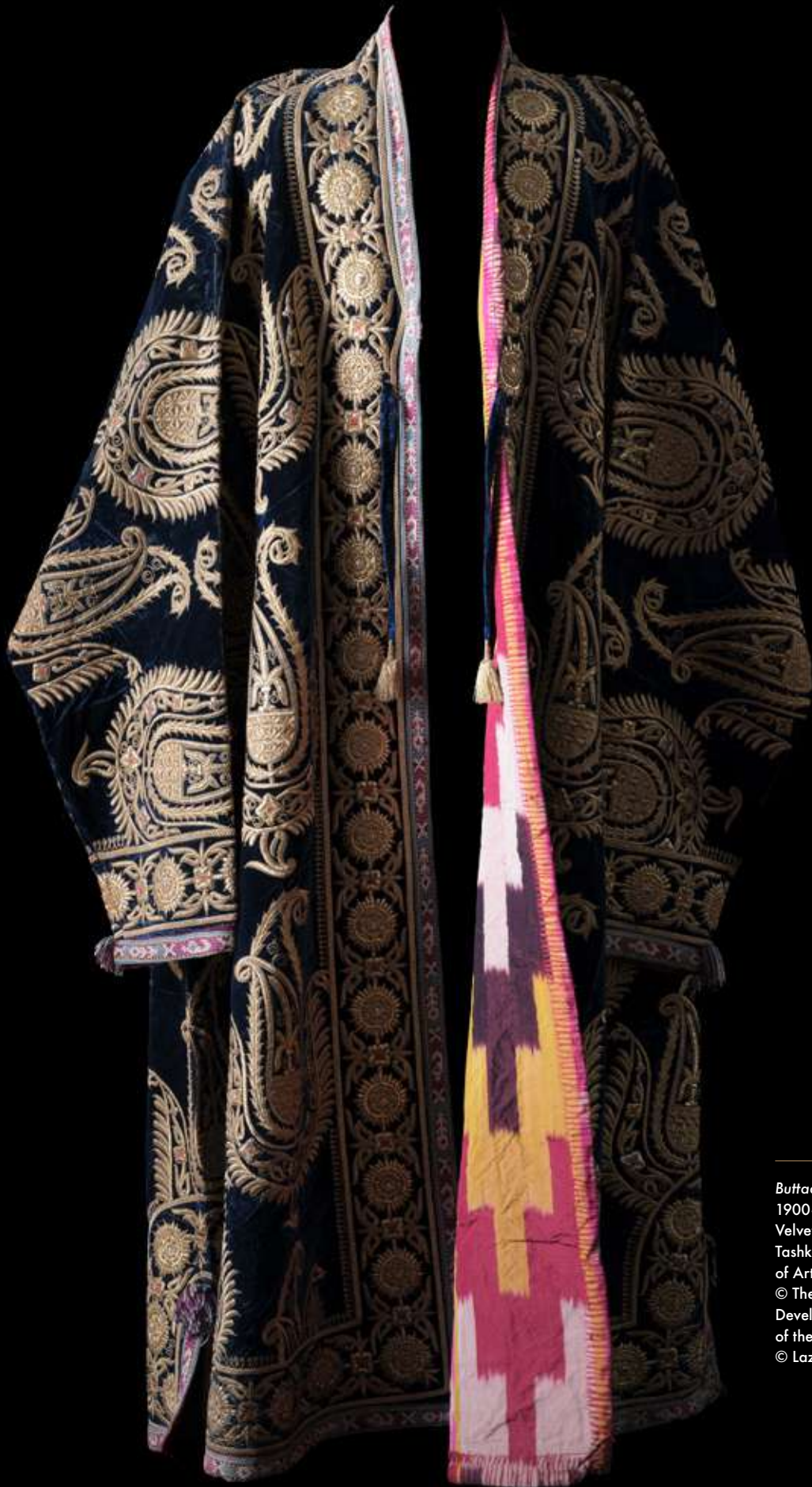
Buttador-style chapan, 1900–1904, Bukhara. Velvet, gold embroidery. Tashkent, State Museum of Arts of Uzbekistan