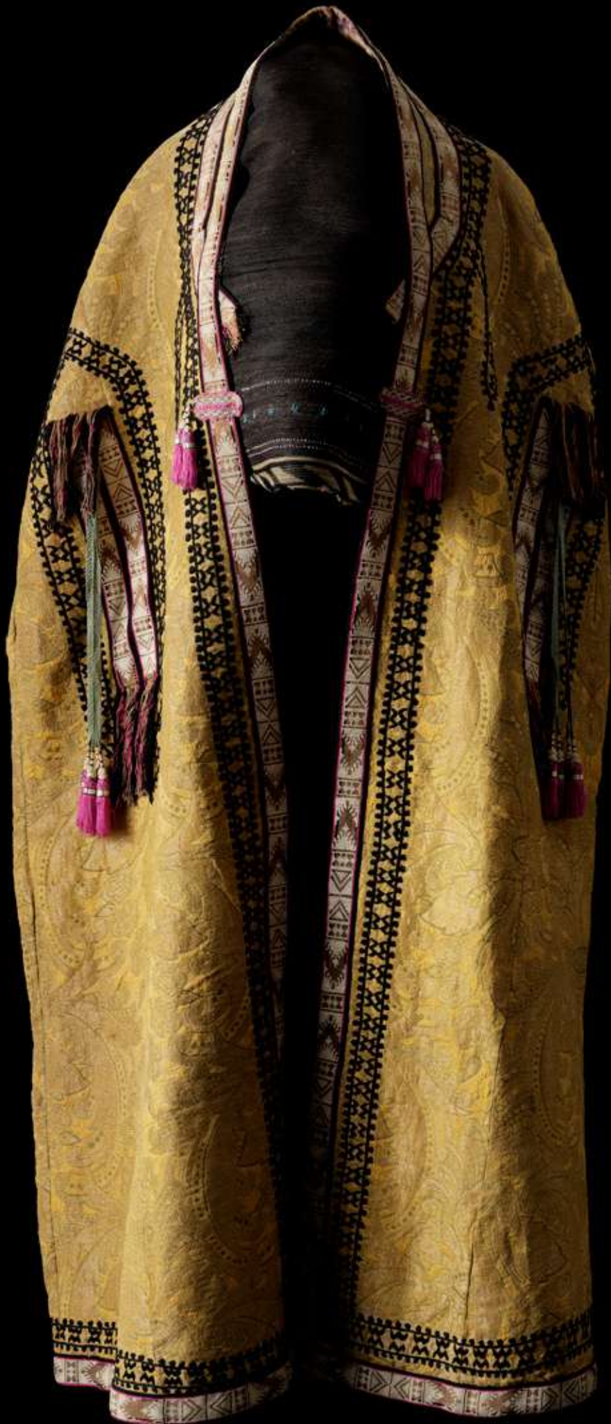
Paranja, velvet, gold embroidery, Tashkent, State Museum of Arts of Uzbekistan