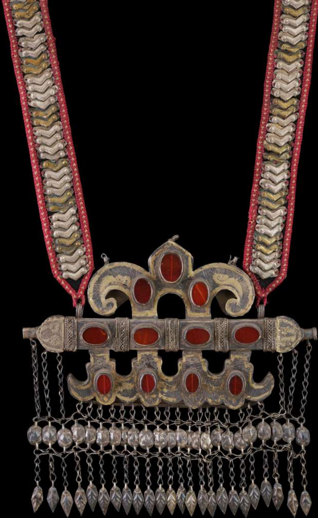
"Haykel" pectoral ornament, late 19th–early 20th century. Metal, stones, Nukus, State Museum of History and Culture of the Republic of Karakalpakstan