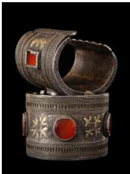
"Bilezik" bracelets, late 19th–early 20th century, Silver, cornelian, red agate, filigree, chasing, Nukus, State Museum of Arts of the Republic of Karalpakstan named after I.V. Savitsky © The Art and Culture Development Foundation of the Republic of Uzbekistan © Andrey Arakelyan