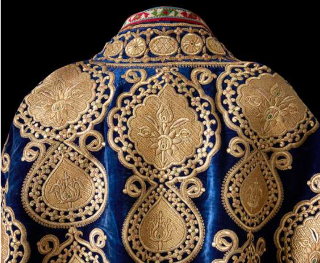
Detail on “ Davkur ” gold embroidered Bakhmal velvet men’s coat, Bukhara, 18th to 19th century, collection of the Amir Timur Museum Tashkent © The Art and Culture Development Foundation of the Republic of Uzbekistan © Laziz Hamani