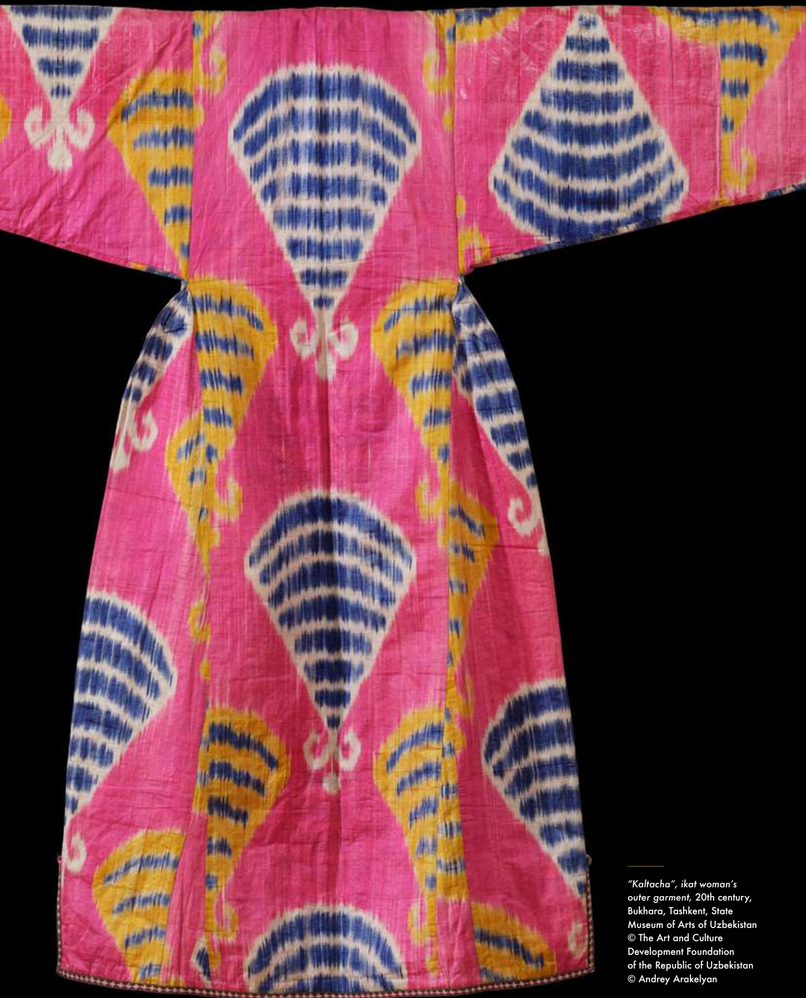
"Kaltacha", ikat woman's outer garment, 20th century, Bukhara, Tashkent, State Museum of Arts of Uzbekistan © The Art and Culture Development Foundation of the Republic of Uzbekistan © Andrey Arakelyan