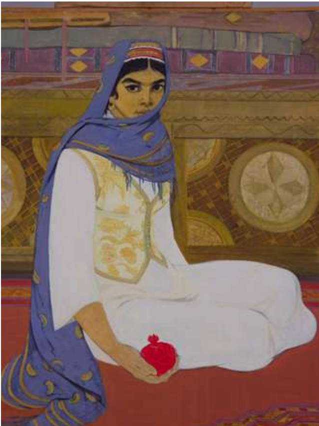
R.Ch. Choriyev, Bride , 1968, Tashkent, State Museum of Arts of Uzbekistan